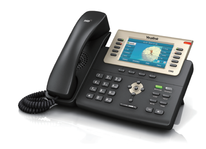
Support Bluetooth Earphone